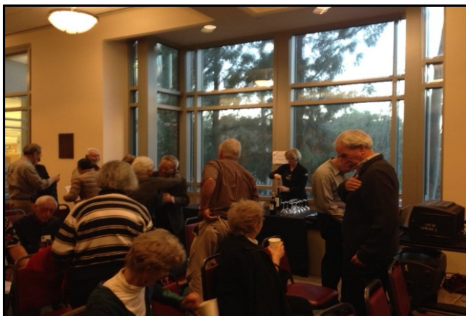
FIGURE D: Arrival of the 'Happy Hour!! Various wines and soft drinks with a wide variety of 'finger food' (hors d'oeuvres reception); available for about one hour.