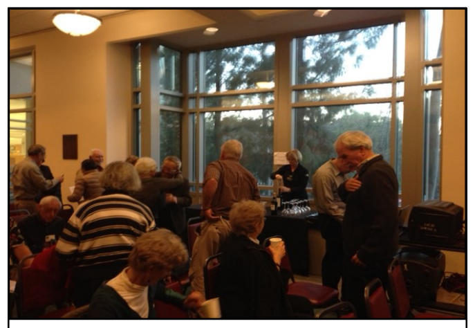
FIGURE D: Arrival of the 'Happy Hour'!! Various wines and soft drinks with a wide variety of 'finger food'' (hors d'oeuvres reception); available for about one hour.